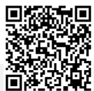
T800-EX 3D demo